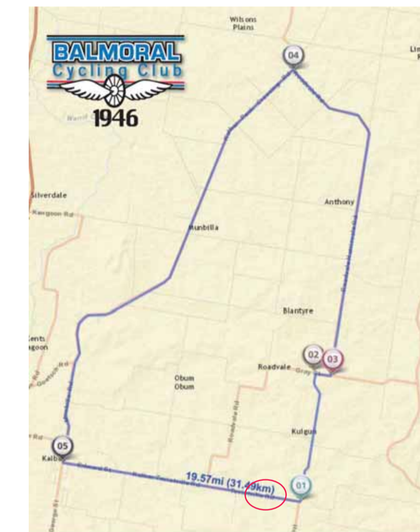
1 - Teviotville Road/Roadvale Teviotville Road 2 - Roadvale Teviotville Road/Gray Street 3 - Gray Street/Roadvale Hamville Road 4 - Roadvale Road/Kalbar Peak Crossing Road 5 - Edward St