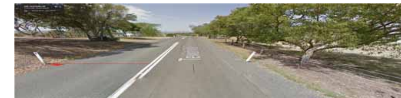
Looking back through KOM – 588 Teviot Road